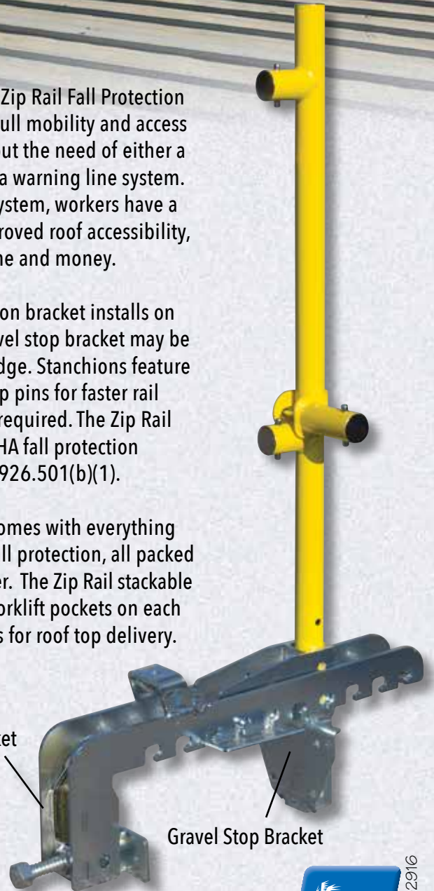
Gravel Stop Bracket

TIE DOWN ENGINEERING • 255 Villanova Drive SW • Atlanta, GA 30336 www.tiedown.com (404) 344-0000 Fax (404) 349-0401