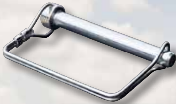
Safety Locking Pin Part #10500 (Kit Quantity: 43)