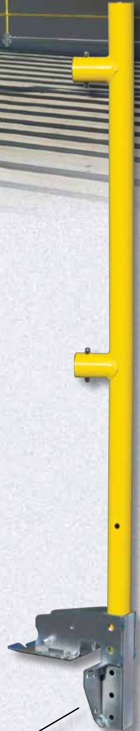
Gravel Stop Bracket

Each Zip Rail System comes with everything needed for 420 feet of fall protection, all packed in one stackable container. The Zip Rail stackable container comes with forklift pockets on each side and hoisting rings for roof top delivery.