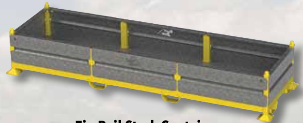
Zip Rail Stack Container Part #70737 (Kit Quantity: 1)