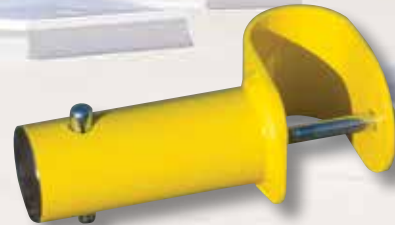
Corner Bracket Assembly Painted Yellow Part #70730 (Kit Quantity: 12)