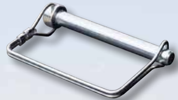
Safety Locking Pin Part #10500 (Kit Quantity: 36)