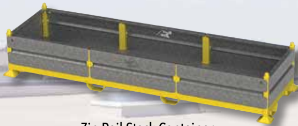
Zip Rail Stack Container Part #70737 (Kit Quantity: 1)