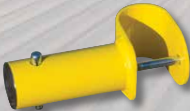
Corner Bracket Assembly Painted Yellow Part #70730 (Kit Quantity: 6)